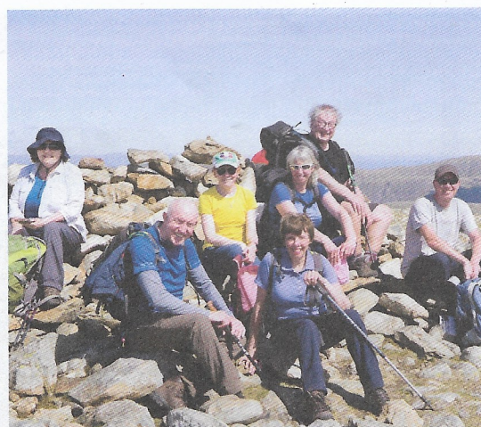
The group enjoying a well-earned rest and spectacular views from the summit of Fairfield.

for two organisations, Alzheimer's Society, who provide dementia support in County Durham,